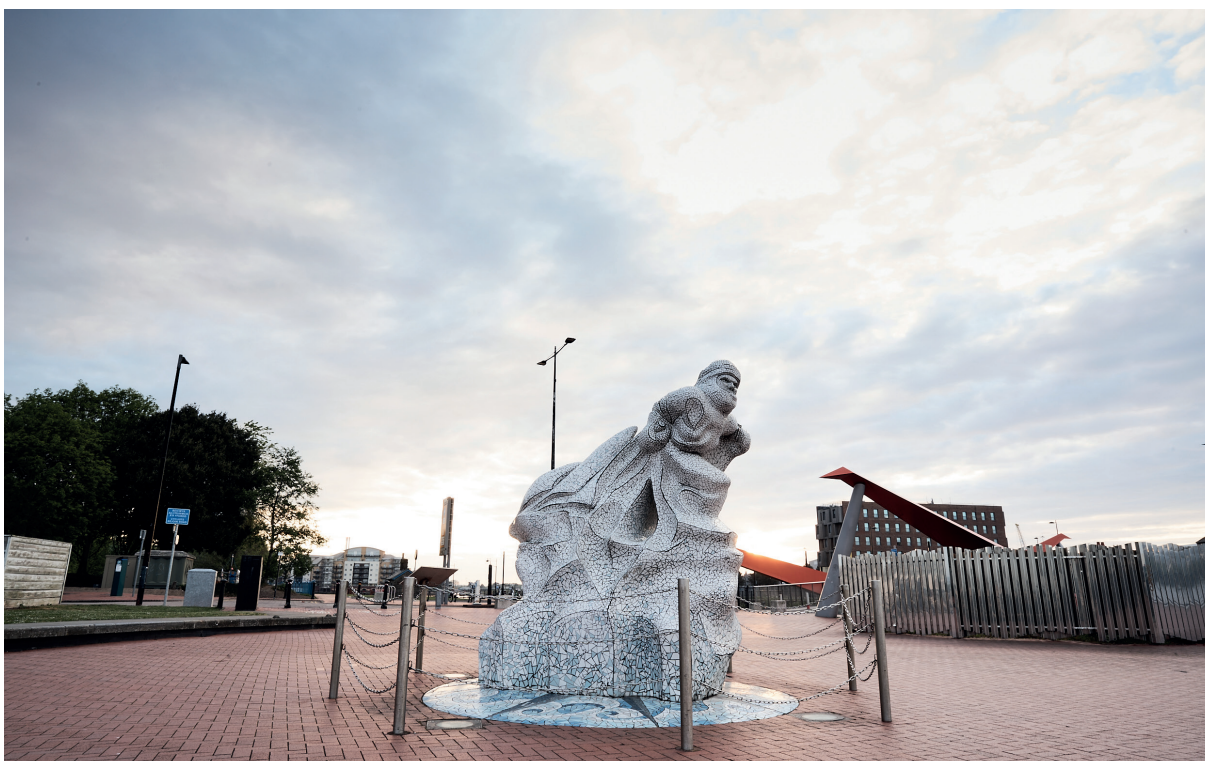
Clockwise from the left: The Wales Millennium Centre with the inscription, 'In these stones, Horizons sing', the Norwegian Church, which Roald Dahl was once patron, statue of Captain Scott who left Cardiff to travel to the South Pole, and the Mermaid Quay buildings in Cardiff Bay.